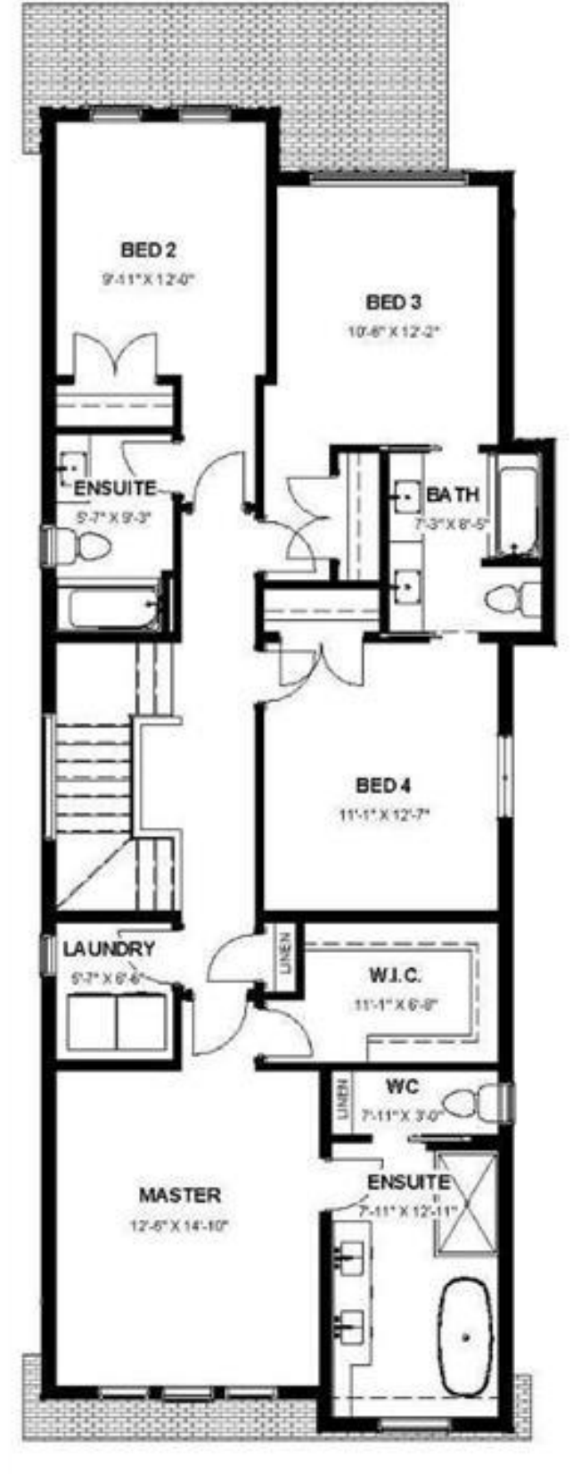
SECOND 1,245 SQ.FT. (4 BEDROOM OPTION)

Listing Office Real Estate Professionals Inc.