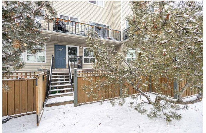
107-3615 49 St NW, Calgary, AB

Main Building: Total Exterior Area Above Grade 404.85 sq ft