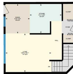
Main Floor Exterior Area 404.85 sq ft

Main Building: Total Exterior Area Above Grade 404.85 sq ft